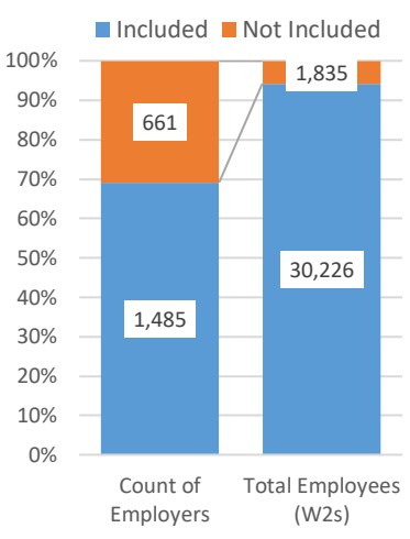
Chart 1. Employers and Employees Distributions: CNMI 2016